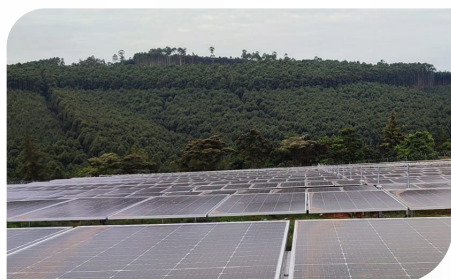
SASINI TEA FACTORY