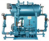
Condensate Pump Station