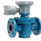
Fuel Flow Meter

We also offer PID Controllers, TIC, Pressure Transmitter, ph Meter, Magnetic Level Gauge etc.