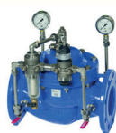
Pilot Operated Pressure Reducing Valve