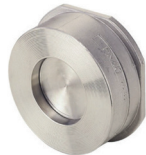
Disc Check Valve